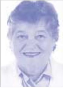
Mel Read MEP, chair of the European Parliament Osteoporosis Interest Group