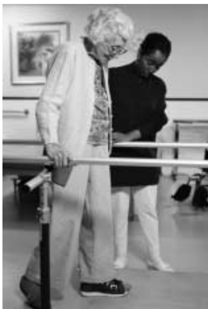
Currently, up to 95% of patients suffering a fragility fracture are discharged without adequate investigation for osteoporosis.