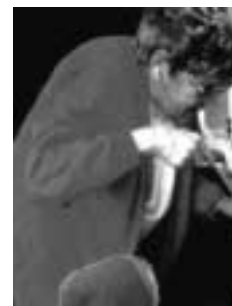
59 years of age