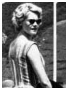
20 years of age