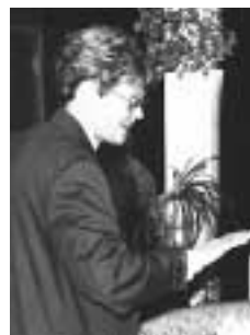
50 years of age